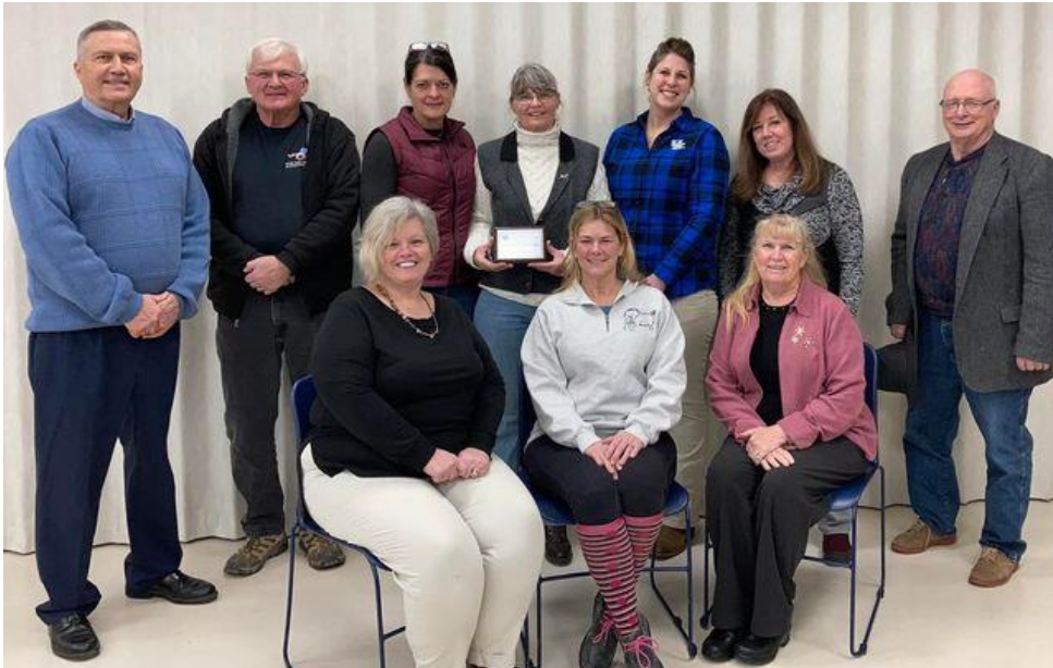
Campbell County 4-H would like to thank the Northern KY Horse Network members for their volunteer service. They were recognized with the Outstanding Community Volunteer Award at the County Extension Council Meeting in January.