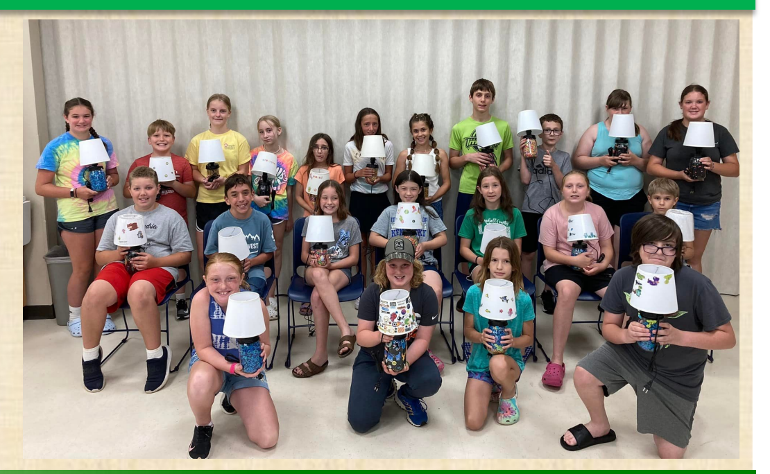
4-H Day Camp, June 14, 2022. The Mason Jar Lamps look great!