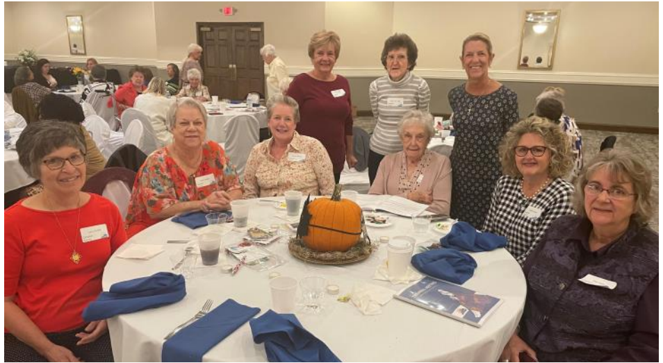
Campbell County Homemakers attended the Triennial Meeting on October 12th at Receptions.