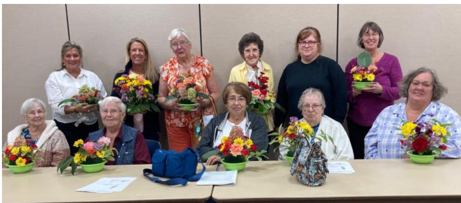
The Valley Homemakers Club had a flower bouquet design program as part of their monthly meeting.