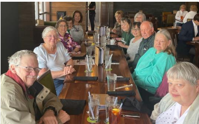
Lunch at Bru Burger in Fort Mitchell.