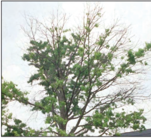
Figure 5. Pin oak with advanced dieback symptoms.

practices that promote tree vigor may help slow the rate of decline.