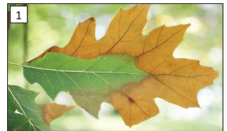
Figure 1. Red oak with scorch along the leaf margin.

relatively quickly, especially under additional environmental stresses, such as drought. However, the disease typically progresses slowly over several years. Foliar symptoms alone are not definitive for this disease since leaf scorch can also occur