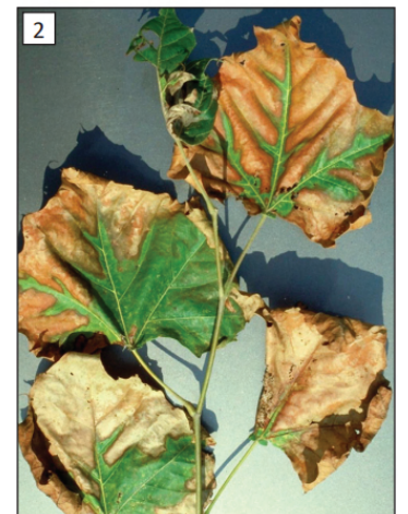
Figure 2. Sycamore leaves with marginal scorch extending to interveinal leaf regions.